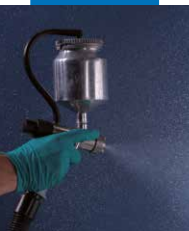
Finishing off Silancolor Tonachino with Mapelux Lucida and MapeGlitter Silver