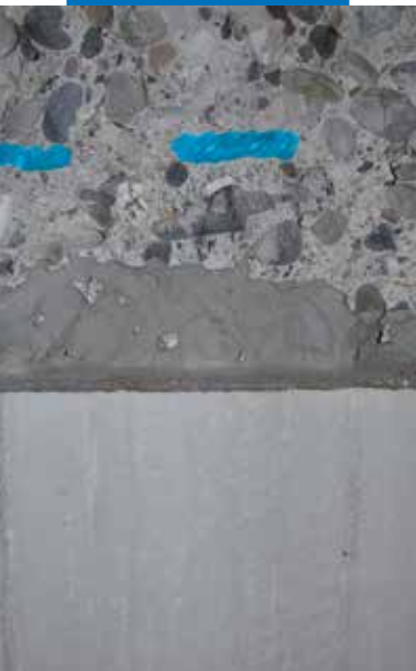
Mapegrout Hi-Flow GF after stripping the formwork

As an alternative, after tamping the surface of the mortar, apply Mapecure E anti-evaporation agent in water emulsion with a low pressure pump, Mapecure S film-forming curing agent for mortar and concrete or Elastocolor Primer , high-penetration solvent fixing agent for absorbent surfaces and curing agent for repair mortar.