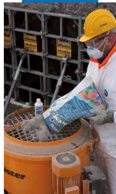
Preparing Mapegrout Hi-Flow GF with an addition of Mapecure SRA