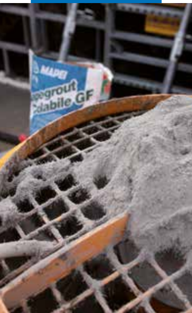
Mapegrout Hi-Flow GF before mixing