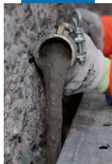
Application of Mapegrout Hi-Flow GF

(*) Performance reached by adding 0.25% of Mapecure SRA