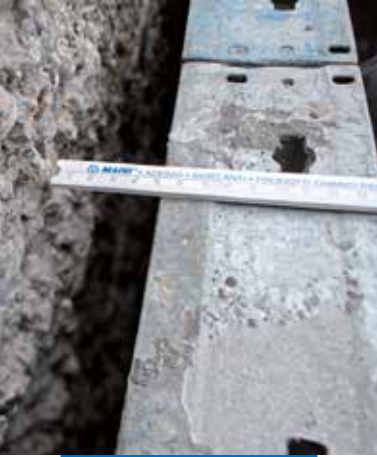
Positioning the sealed formwork once it has been carefully prepared