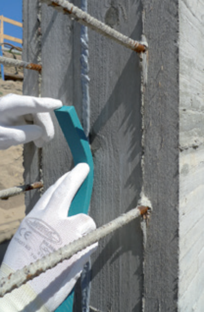
Applying Idrostop Soft on vertical surfaces