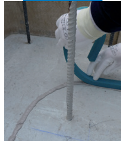
Applying Idrostop Soft on horizontal surfaces

All relevant references for the product are available upon request and from www.mapei.com